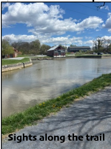
Sights along the trail

A HUGE THANK YOU TO OUR SPONSORS FOR MAKING THIS DAY A SUCCESS!!